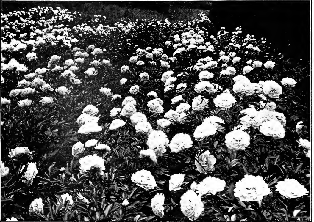
Triomphe de l'Exposition de Lille and Marguerite Gerard